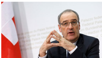
Guy Parmelin, Federal Councillor Head of the Federal Department of Economic Affairs, Education and Research (EAER)

Guy Bernard Parmelin was born in Bursins (Vaud) on 9 November 1959. He holds a federal baccalaureate specialising in Latin and English. Following a farming apprenticeship, he obtained a diploma from the agricultural college at Marcelin in 1979. In 1985, he obtained a Federal PET Diploma in agriculture and winemaking.